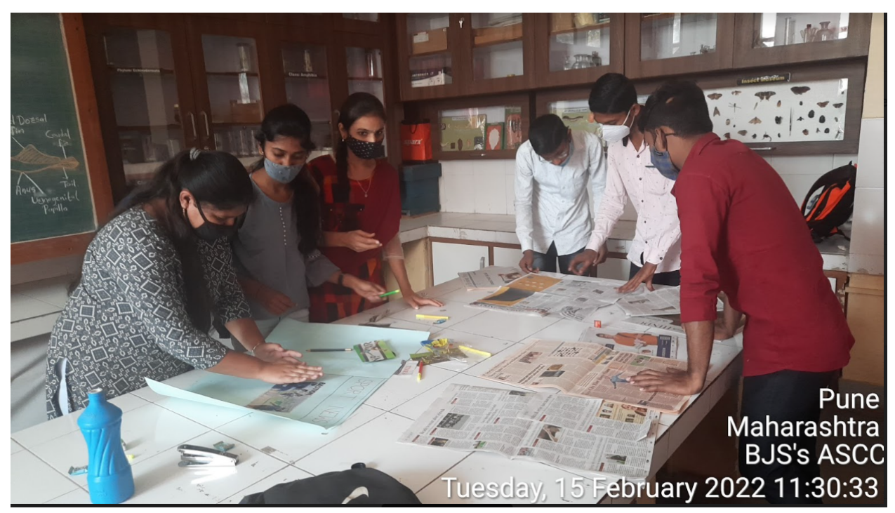
Soft Skills Development Activity : Teamwork Skills - FYBCA