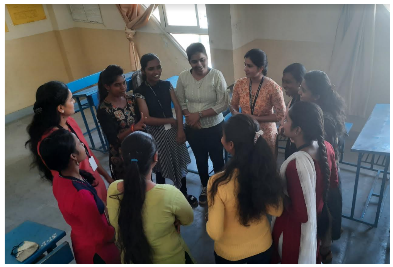
Group Discussion and verbal games for FYBA