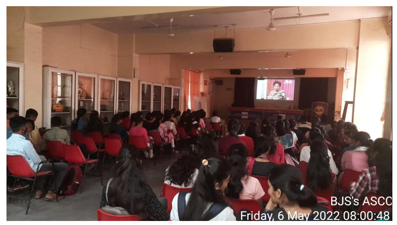
Screening of Indra Nooyi's Interview for FYBCom students