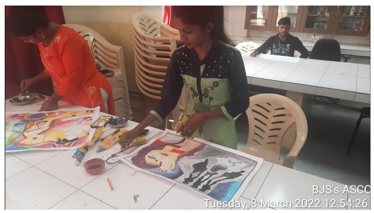
Poster making competition on 'Break the Bias: Imagine a Gender Equal World'