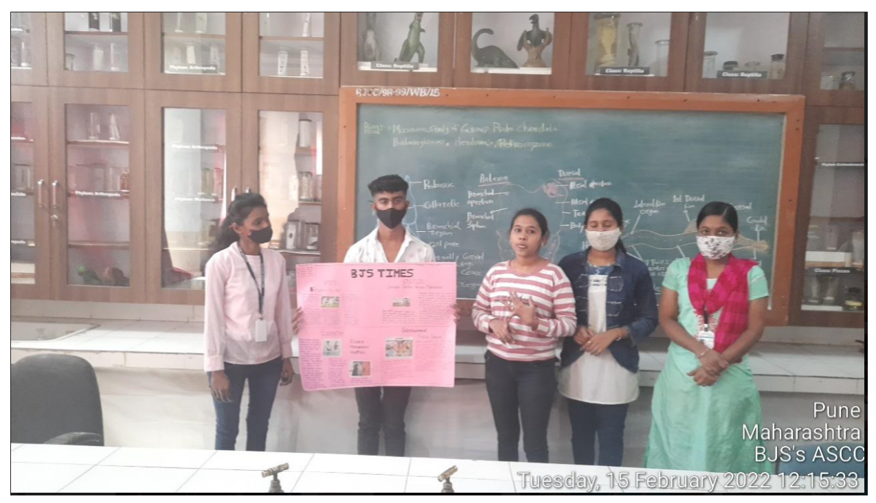
Soft Skills Development Activity : Presentation Skills by FYBCA