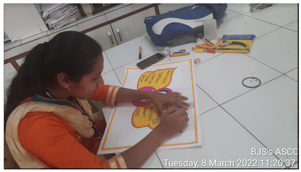
Poster making competition on 'Break the Bias: Imagine a Gender Equal World'